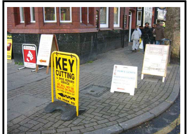
The advertising A-boards of Kings Heath High Street. We think they look a mess and are an obstruction to pedestrians.

The number of new graffiti tags has dramatically reduced since the issuing of Anti-Social Behaviour Orders against 4 individuals responsible for most of the tags in Moseley and Kings Heath. Nearly all the graffiti tags on unpainted surfaces have been removed. We now intend to paint over any graffiti on painted or rendered surface in the coming weeks.