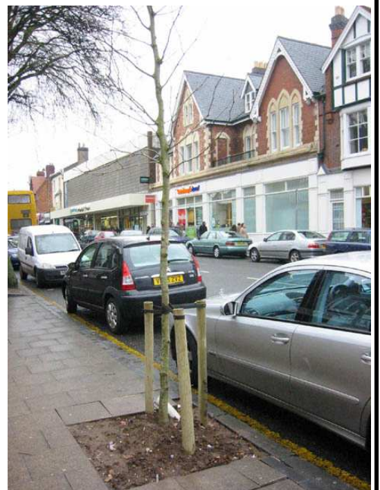
One of the two new London Plane trees planted in Victoria Parade, Moseley during December.