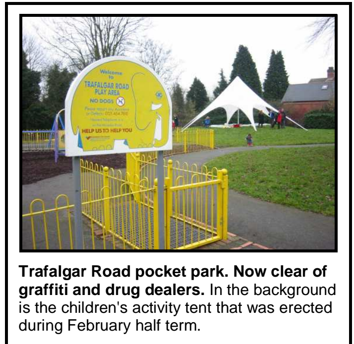
Trafalgar Road pocket park. Now clear of graffiti and drug dealers. In the background is the children's activity tent that was erected during February half term.