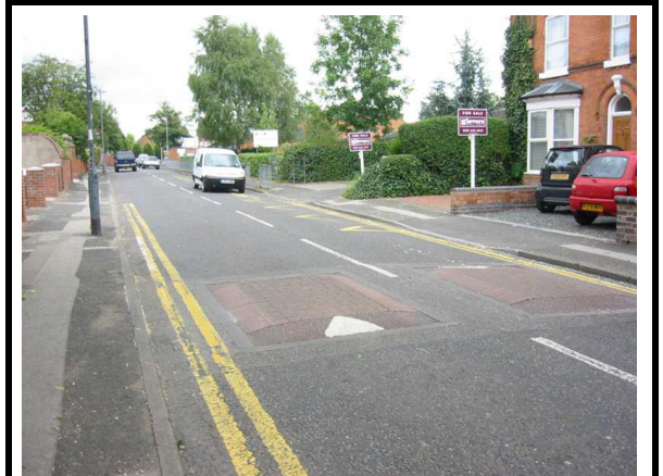
Valentine Road. Labour claim Liberal Democrats want to remove these speed cushions. If they had checked their facts, they would know this is rubbish!

Kerb-to-kerb speed humps dramatically slow down emergency vehicles, thereby affecting their response time. There will now be a presumption against kerb-to-kerb speed humps in roads identified as 'Blue Routes'. 'Horizontal' traffic calming, or when deemed necessary, speed cushions will be allowed on 'Blue Routes'. Horizontal traffic calming includes chicanes, pinch points or speed cameras.