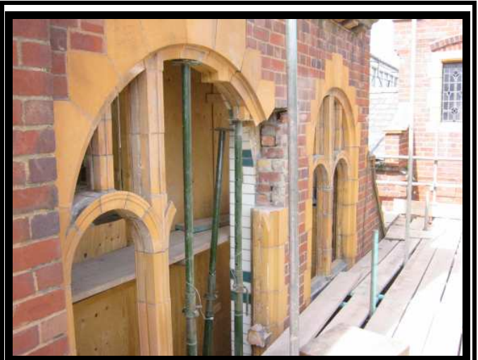
The above photograph shows the rebuilding of the terracotta windows in Pool 2. New terracotta blocks have been made to replace any that have crumbled.

Only Pool 2 will re-open in October. Pool 1, the larger of the two pools will remain closed until the money can be found for its restoration. Martin has already met with the Heritage Lottery Fund. As a result, he has received agreement from the Council for a necessary £200,000 Conservation Survey of the baths, subject to Cabinet Approval in October.