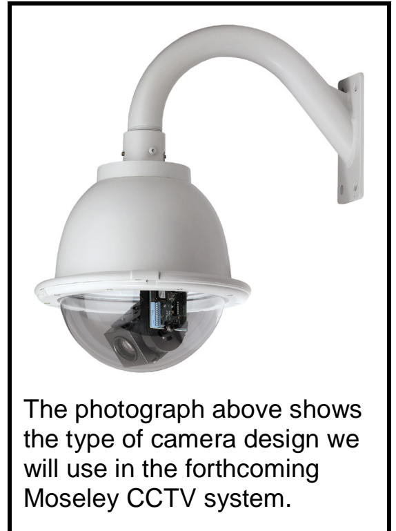
The photograph above shows the type of camera design we will use in the forthcoming Moseley CCTV system.

Your local Liberal Democrat Councillors have taken on the full responsibility of resolving the current and future funding of Kings Heath CCTV. They were therefore appalled by a recent Labour Party leaflet that claimed the Lib Dems wanted to turn it off—this is far from the truth.