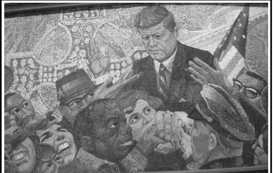
The above photo shows a segment of the 1968 mosaic. At 12m long and 3m high, the mosaic contains the image of President John F Kennedy surrounded by a crowd of people of all creeds. Two of the faces in this crowd are Martin Luther King and Senator Edward Kennedy. Behind President Kennedy are images that represent parts of his life and Presidency including his wife, the Presidential Seal and The Cuban Missile Crisis

More on the history of this monument and the restoration can be found at martinmullaney.blogspot.com