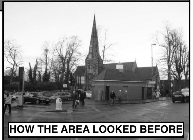
HOW THE AREA LOOKED BEFORE