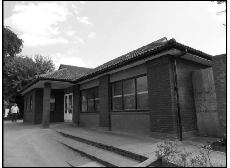
The disused Bowling Green Pavillion in Kings Heath Park We are hoping to offer this to the operator of the Victorian Tea Room to use as a kitchen and servery for their present location

These will be built on the side of the Victorian Tea Rooms and will be accessible to both park users and Tea Room customers. At present there are no disabled toilets with the female toilets inconveniently upstairs inside Kings Heath House.