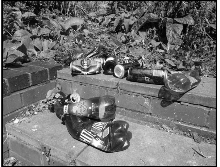
Debris from street drinkers near Moseley Private Park

As a result thirteen individuals were issued with letters at the end of June, informing them that evidence was now being collected in preparation for the issuing of Anti-Social Behaviour Orders (ASBOs) against them. They are also being directed to agencies that can help get them off their alcohol addiction.